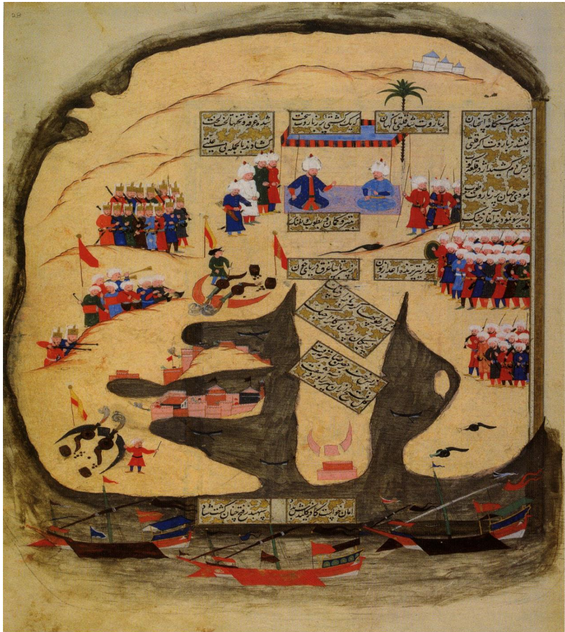
The fourth model: Siege of Malta & Manuscript History of Sultan