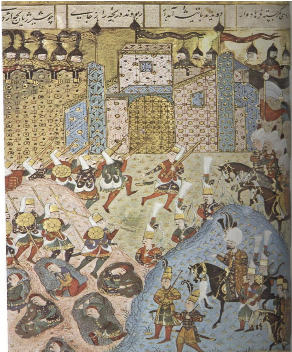
The seventh model: The siege of Rhodes & Manuscript of Suleymannama & 965AH. 1558AD. & Topkapi museum H1517