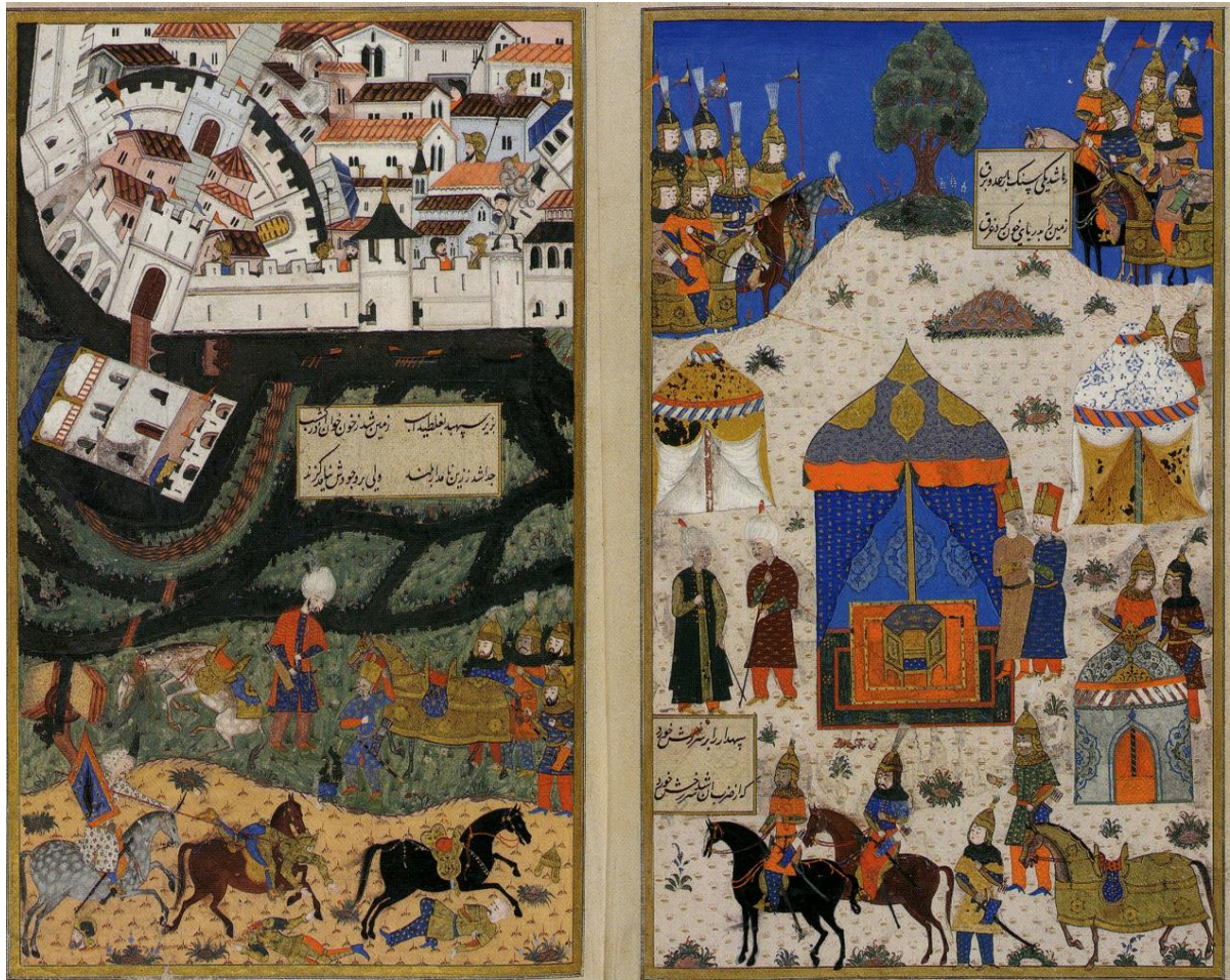
The first model: The siege of Tamisfar city & Manuscript of Ftuhat Jamela & 964AH.1557AD. & Library of the University of Istanbul