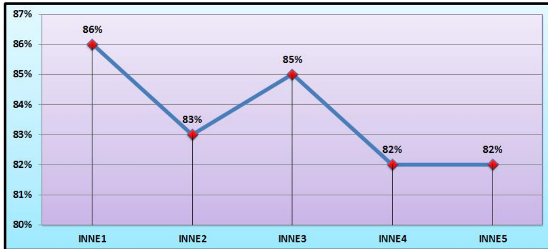
Figure (4) The order of the relative importance of the paragraphs of the communication networks dimension

Figure (4) indicates that the first paragraph (INNE1) came first with an importance of (86%) because it had the highest relative importance, then followed in that the third paragraph (INNE3) with importance (85%), then the second paragraph (INNE2) with importance ( 83%), followed by the fourth paragraph (INNE4) and the fifth (INNE5) with importance (82%).