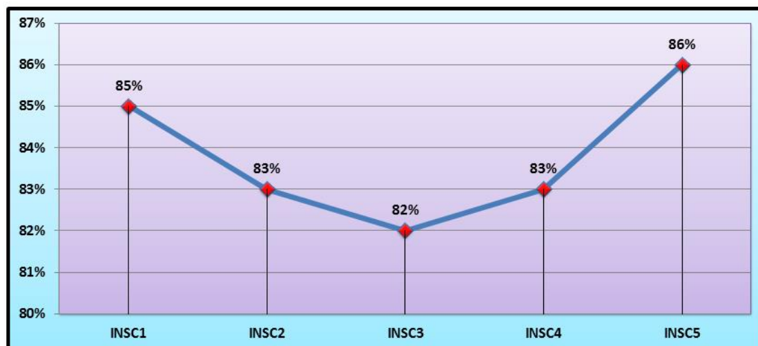
Figure (2) The order of the relative importance of the software components dimension paragraphs

Figure (2) shows that the fifth paragraph (INSC5) came first with an importance of (86%) because it had the highest relative importance, then followed in that by the first paragraph (INSC1) with the importance of (85%), then the second paragraph (INSC2) and the fourth ( INSC4 with importance (83%), and finally the third paragraph (INSC3) with importance (82%).