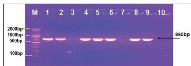
Figure-2: Agarose gel electrophoresis; positive bands of serotype A virus of foot-and-mouth disease in samples 1, 2, 4, 5, 6, 8, and 9.