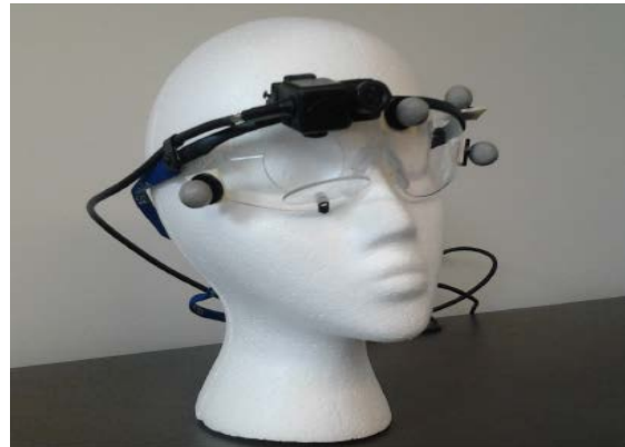
Fig. 2: Represents the wearable eye gaze device (McMurrrough et al. , 2013)

Another arrangement of wearable eye gaze glasses with a low-cost webcam was introduced by Jen et al. (2016) for detecting the region of interest and this work also provides high degrees of accuracy and robustness. Depending on the recently existing eye gaze detection methods, the wearable based classification methods are implemented in various applications. Kim et al. (2012) present a monitoring system for both eyes equipped with three mini cameras and two mirrors for extracting the regions of interest depending on the detection of binocular gaze. Yip et al. (2016) present a controlling interface for surgical manipulators based on wearable