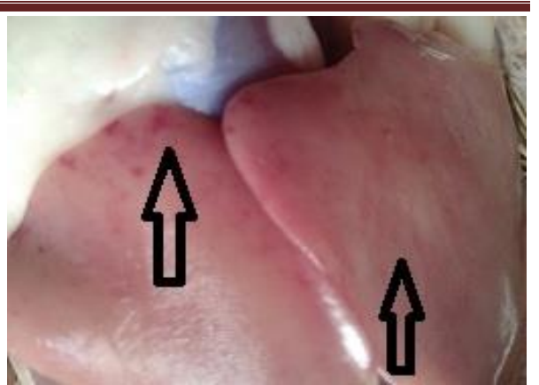
Fig. (2): Enlarged muddy yellowish discolorration with friable consistency and sub capsular hemorrhages at 42 days of age in G2.