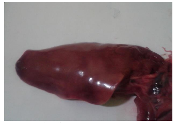
Fig. (3): G1 Slight changes in liver at 42 days of age.

absorption and reduced pancreatic digestive enzyme production (30) and consequently reduced appetite (31). The body weight of chickens did not differ significantly (P<0.05) between vaccinated group G3 and the control throughout the period of the experiment. The differences in body weight between the groups narrowed down and towards the end of the experiment, were not statistically significant (P<0.05). These results agreed with (32) who refer that the body weight of vaccinated group with IBD vaccine was less than the control. On the other hand, the most decrease in body weight was in vaccinated group that fed a ration with mycotoxins G2 along the period of experiment in comparison with control group which recorded (P<0.05) in first week after first vaccination and (p<0.05) after second vaccination, that may be reveal the synergistic effect of both (vaccine and mycotoxin) which causes very