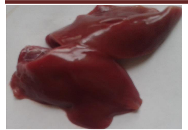
Fig. (1): Mahogany normal liver at 42 days of control group (G5).