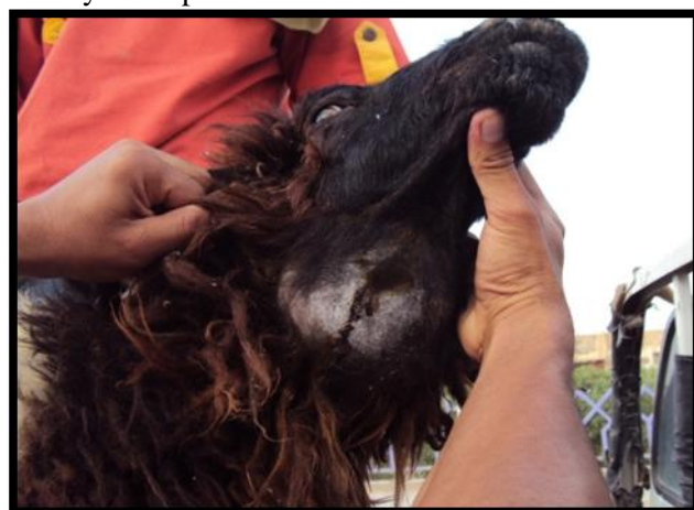
(Image:6) ) large, tension subcutaneous abscess in larynx region, contain gases with black color and odorous odor pus