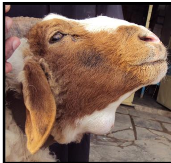
( Image:5) subcutaneous abscess showing white creamy color pus in submandibular in Ram