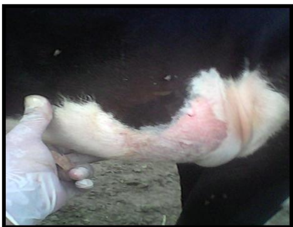
(Image:3 ) large, tension subcutaneous abscess in subaxillary (above a thoracic ribs ) in cattle