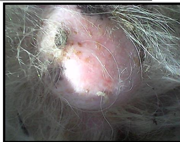
Image:8). subcutaneous abscess in the tail of Ram was contain thick dried pus