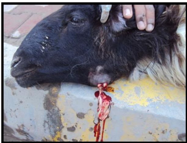
(Image:7) A ram affected with subcutaneous Abscess showing white creamy color pus in submandibular