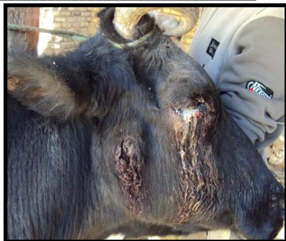
(Image:4) reptured subcutaneous abscess in cheek of cattle with affected eye by contamenation with pus