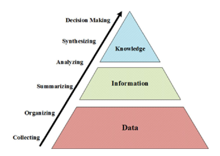
Figure 2. Relationship between Data, Information and Knowledge

The work of (Henderson and Harris, 1999) shows that knowledge is one of the key elements in an integrated series that begins with the signals and ranges to data, information, knowledge and then to wisdom (the latter is very effective for innovation). The effective, solid and sufficient knowledge is the essence of the wisdom, creativity and innovation. The following figure (figure 2) shows the relationshipsbetween data, information and knowledge.