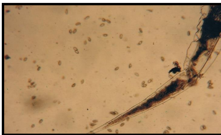
Figure (2): Posterior end of Enterobius with eggs.