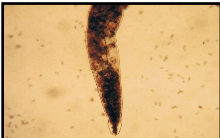
Figure (1): Anterior end of Enterobius.