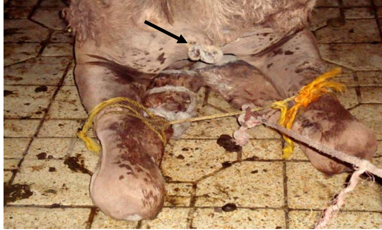
Fig (1): Papillomatosis in 6 years she-camel on the brisket.