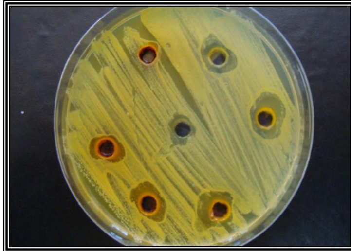
Fig. (3): Inhibition zones of Candida albicans growth on SDA resulting from the use of ethanolic extract of Aloe vera , the peripheral six wells contained extract concentrations (25, 50, 100, 150, 200, 400 mg/ml) while the central well contained 0.1 ml of ethanol at a concentration of 96%.