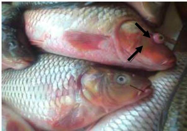
Fig 1.H.S,with exophthalmos ,loosing scales ,redness area