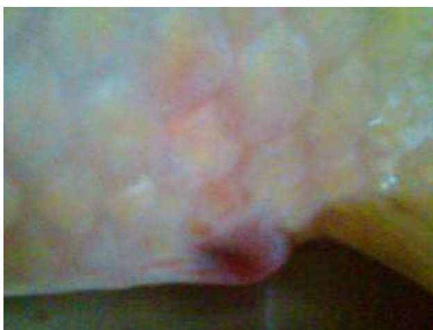
Fig.5.swollen congested vent( bact.enteritis) bact.enteritis )