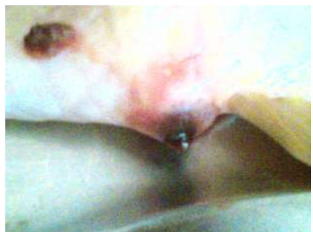
Fig.6. swollen anal area with clotted blood (