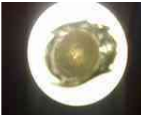
Fig.8 encysted metacercaria X40