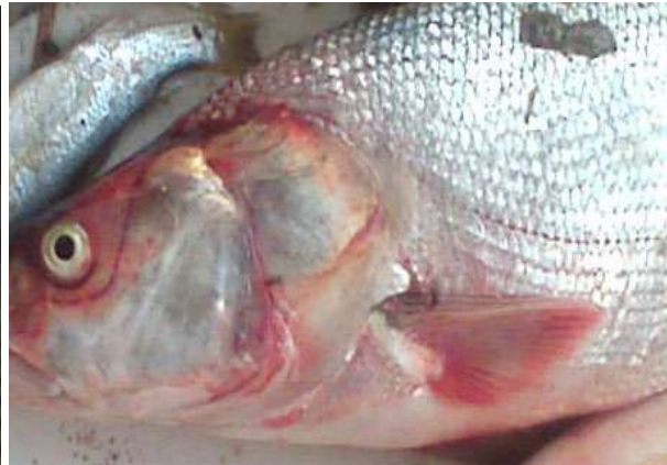
Fig 2.Skin with hemorrhagic areas