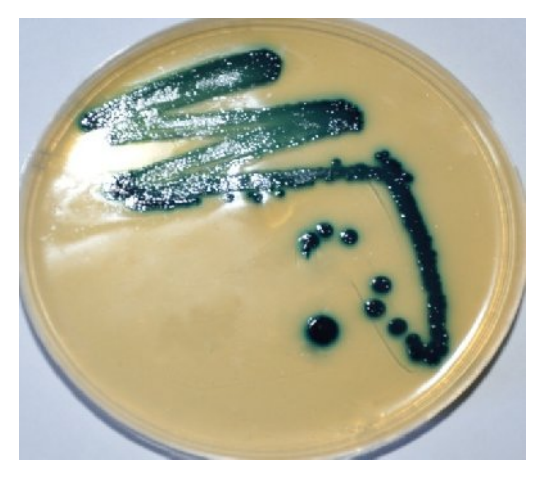
Figure (2) Growth of K0 pneumoniae on A Chrom agar