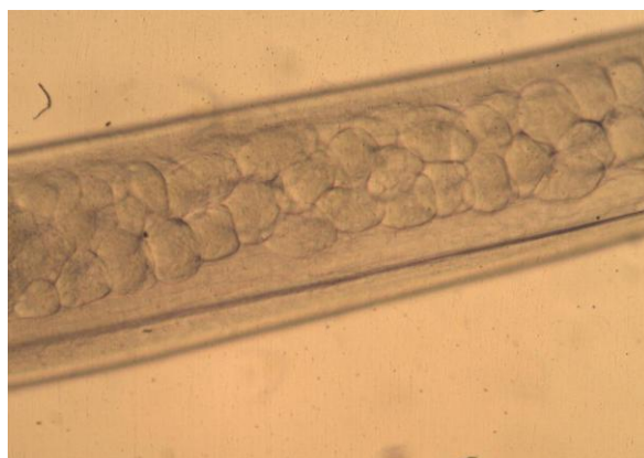
Fig. 7: Cosmocercoides variabilis female trunk with eggs