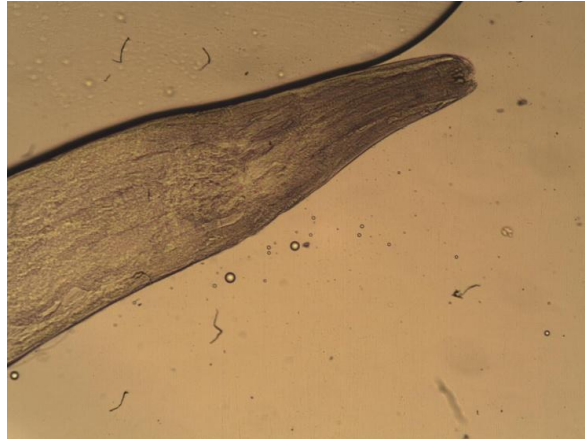
Fig. 5: Cosmocercoides variabilis anterior end