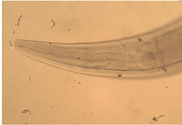
Fig. 3: Cosmocerca commutata anterior end