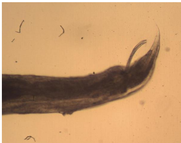
Fig. 4: Cosmocerca commutata male posterior end