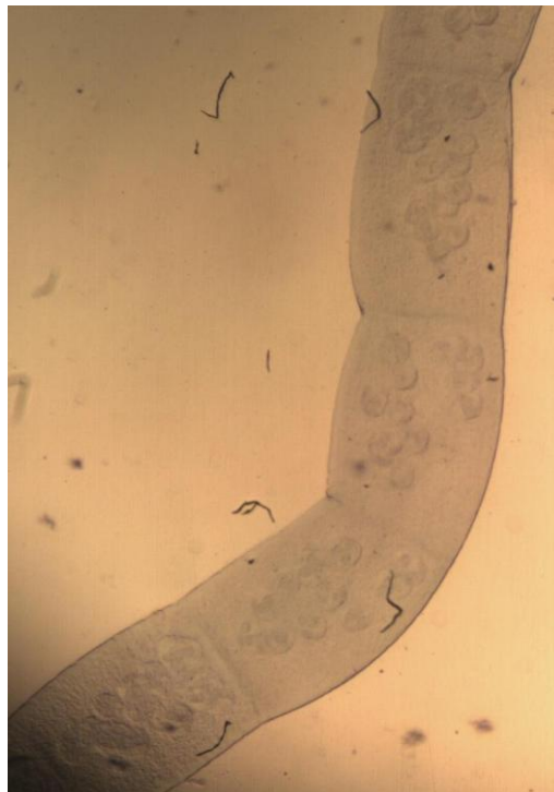
Fig. 2: Nematotaenia dispar gravid segments