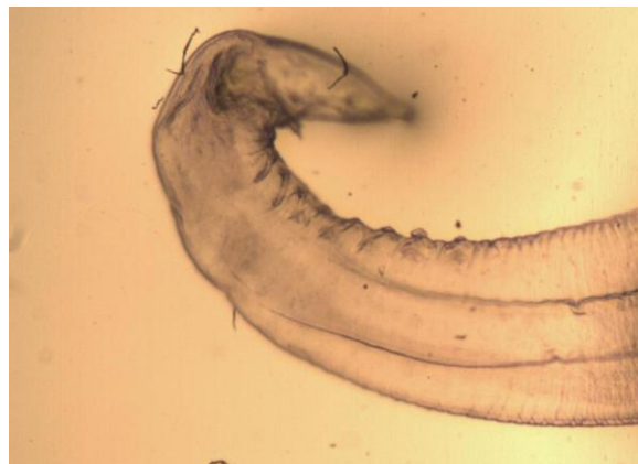
Fig. 6: Cosmocercoides variabilis male posterior end