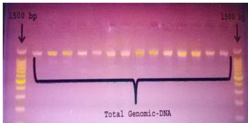
Figure (1): Total genomic DNA extracted from isolates using 1.5% agarose gel electrophoresis.

pyogenes . The DNA of twenty seven isolates was extracted and purified by using ZR Fungal/Bacterial DNA Mini Prep kit. The results were detected by electrophoresis on 1.5% agarose gel and exposed to UV light in which the DNA appeared as compact bands. (Figure-1)