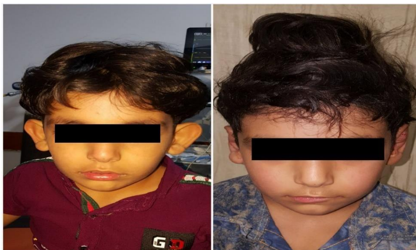
Figure 1. pre- and post-operative child less than 10 years with prominent ear

1. position of ears related to scalp and if there is any asymmetry. 2. recurrence of the prominence. 3. patient satisfaction 4. extrusion of stiches 5. scar problems.